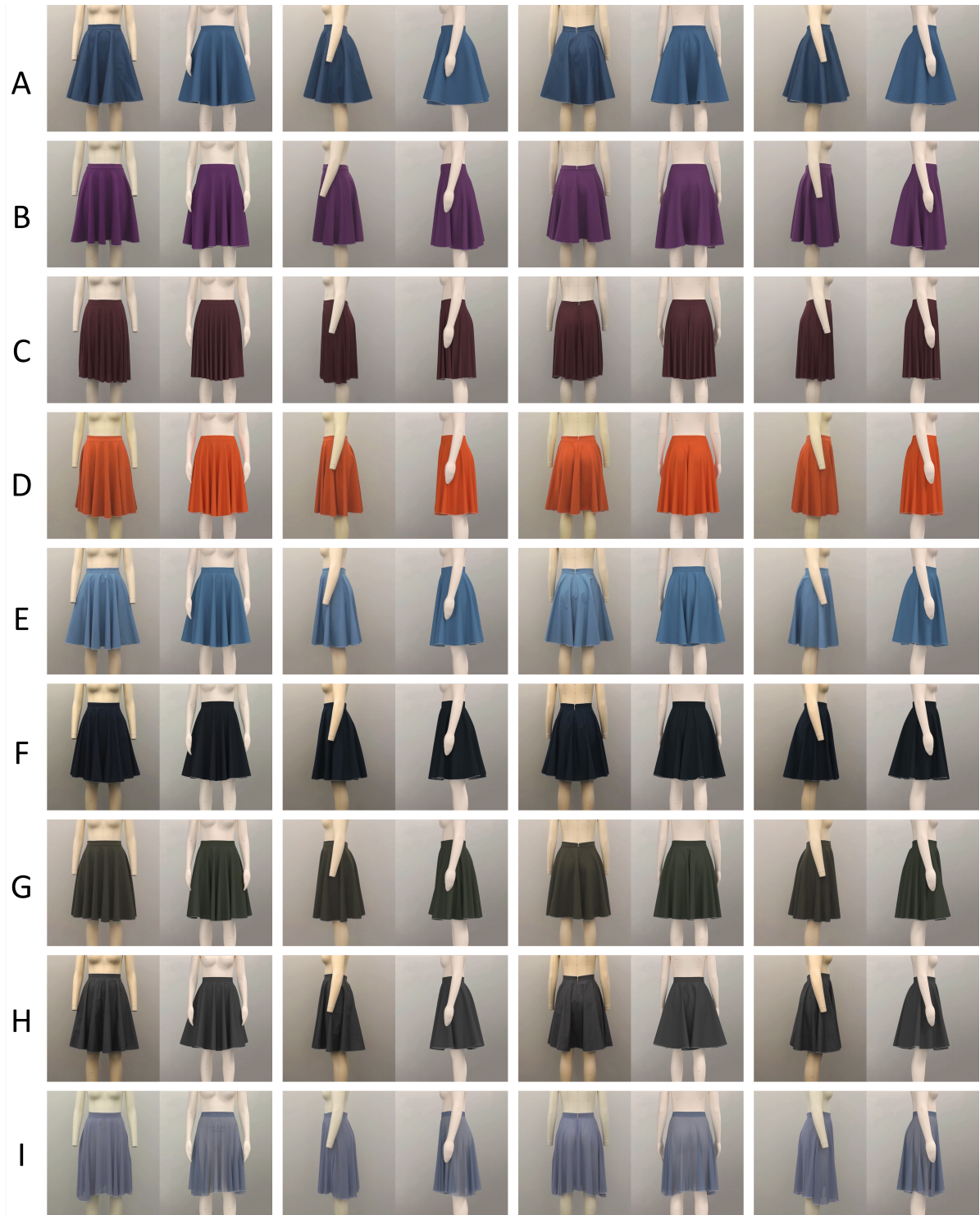
Figure 4: Flared skirt examples. (Left) Actual garments. (Right) Simulated results by estimated parameters. The tag information of each fabric is the same as in Fig. 9 in the main paper.